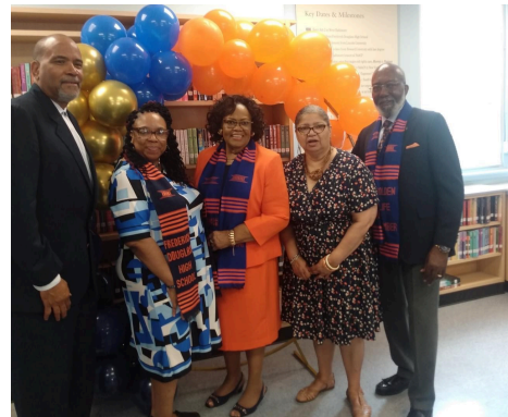
Alumni Weekend Committee