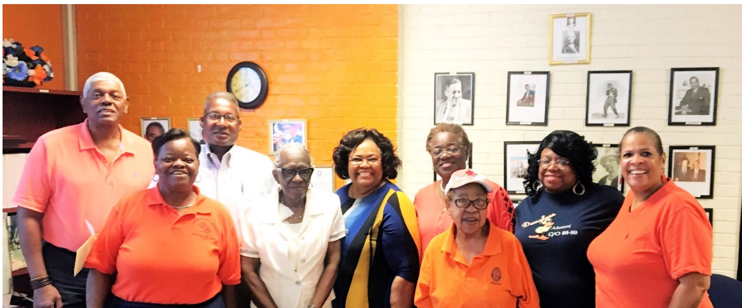
**Other alumni were present prior to picture being taken

What a wonderful and fulfilling day we had as "Helping Hands" . It was as though we were "Turning Back the Hands of Time" being a part of Opening Day at Frederick Douglass High School once again. The members of the Alumni Association look forward to future opportunities to assist when needed to serve the students of Our Alma Mater. Hail to Thee Oh Douglass High!!